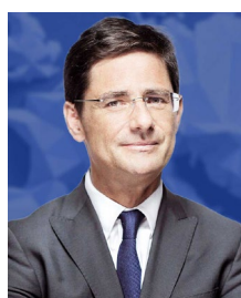
Nicolas Dufourcq DG de Bpifrance