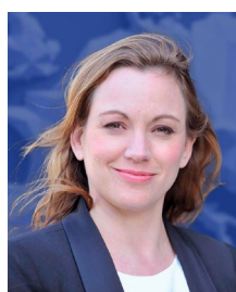
Axelle Lemaire Ex-Secrétaire d'Etat du Numérique et de l'Innovation