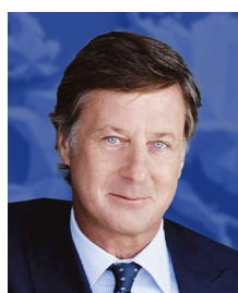
Sébastien Bazin PDG AccorHotels

CONTACT: contact@thedigitalnewdeal.org | WEBSITE: www.thedigitalnewdeal.org